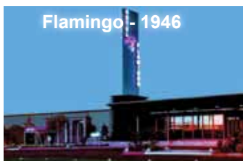
Flamingo - 1946