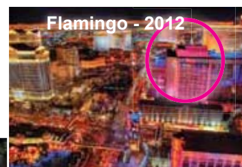
Flamingo - 2012

At the Flamingo in Las Vegas, ironically the same place where the infamous mobster and killer Bugsy Siegel is memorialized, more than 200 professionals from 9 countries gathered to discuss a more insidious and prolific killer - radon.