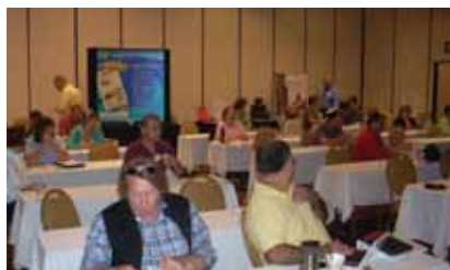
Midwest Chapter of AARST

The Chapter offered 12 hours of Category I CE courses: Radon Measurement in Multifamily Homes, Fighting the Radon Wars: New Marketing Tools, and Large Building QA/QC.