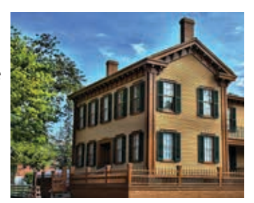
Lincoln's home in Springfield, II

The Symposium will take place at the Abraham Lincoln Hotel and Conference Center, located in the heart of historic downtown Springfield near the Lincoln Presidential Museum & Library and many other historic attractions, including Lincoln's Home, Lincoln Herndon Law Office, and the Old State Capitol.