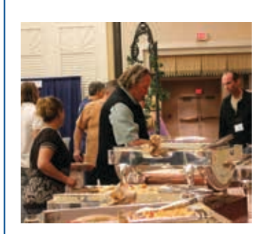
The Exhibit Hall provides the backdrop for the Symposium Welcome Reception and Breaks.

2013 Symposium attendees will include hundreds of radon industry professionals, representatives from the basement health industry, and - thanks to training classes that are being held by ALA and Illinois - code officials and contractors.