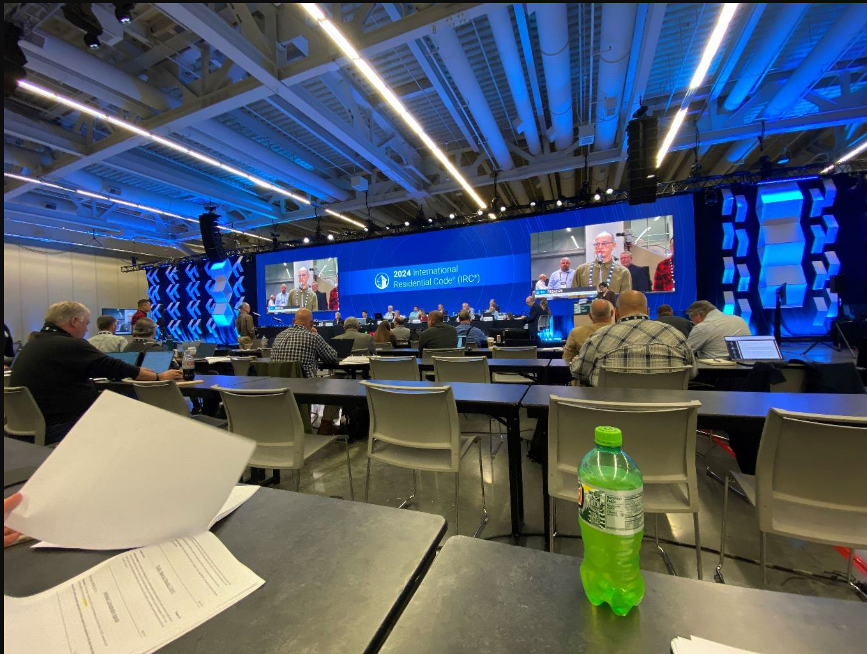
Indoor Environments™ 2025 - Radon and Vapor Intrusion Symposium