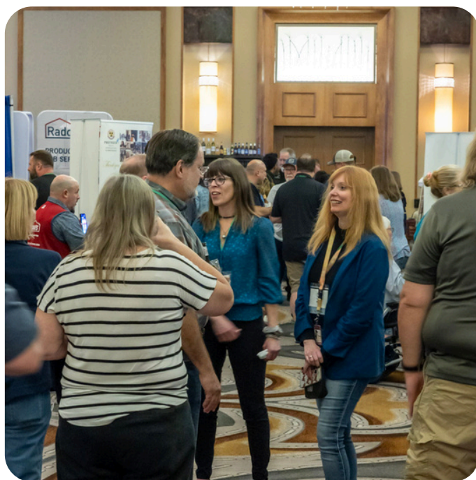
EXHIBIT HALL ATTENDEE TIMES

Registration for Name Badges will open Sunday AM.