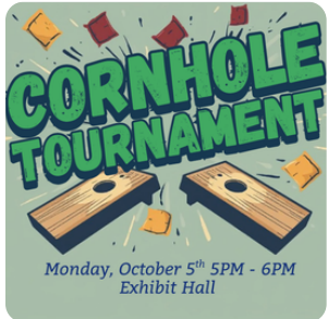
Exhibit Hall Cornhole Tournament

Attendees can visit the registration desk on Monday and Tuesday to get your sponsor-branded sleek plastic refillable bottle of cold water. Attendees receive Water Bottle Tickets with your brand at check in they can redeem.