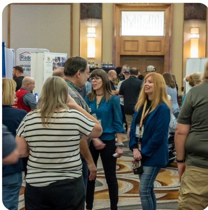
EXHIBIT HALL ATTENDEE TIMES

Registration for Name Badges will open Sunday AM.